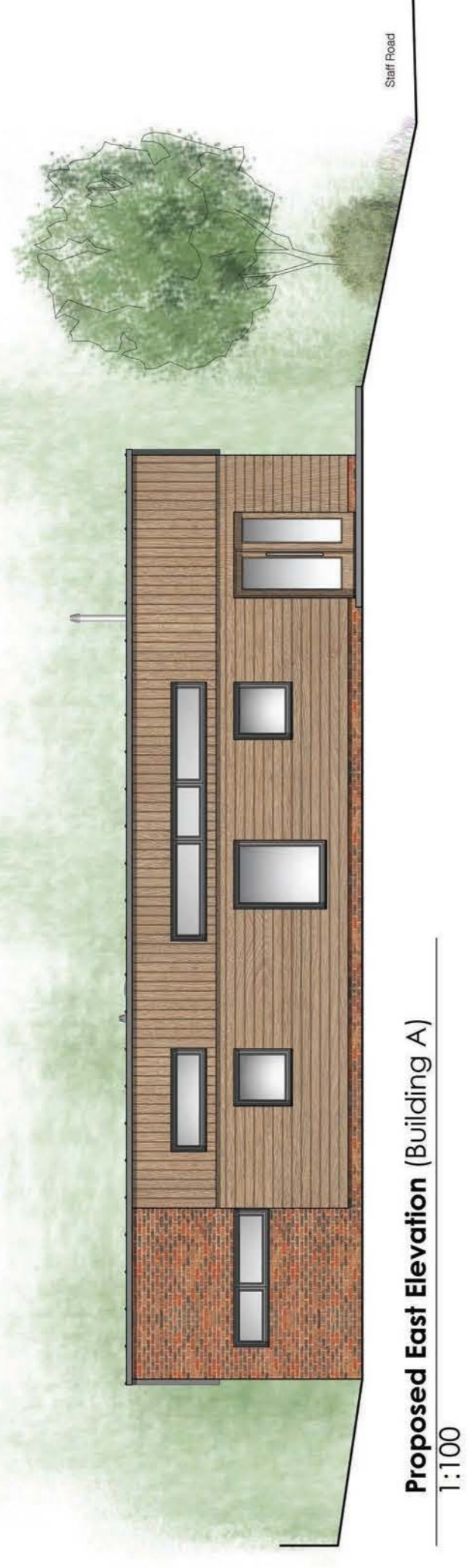
Proposed East Elevation (Building A) 1:100