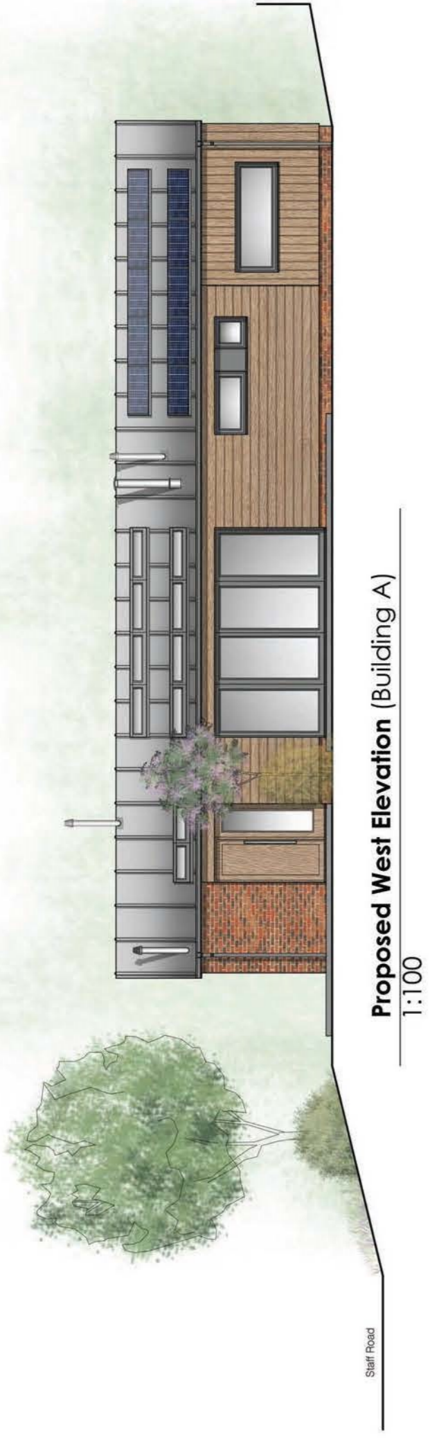
Proposed West Elevation (Building A) 1:100