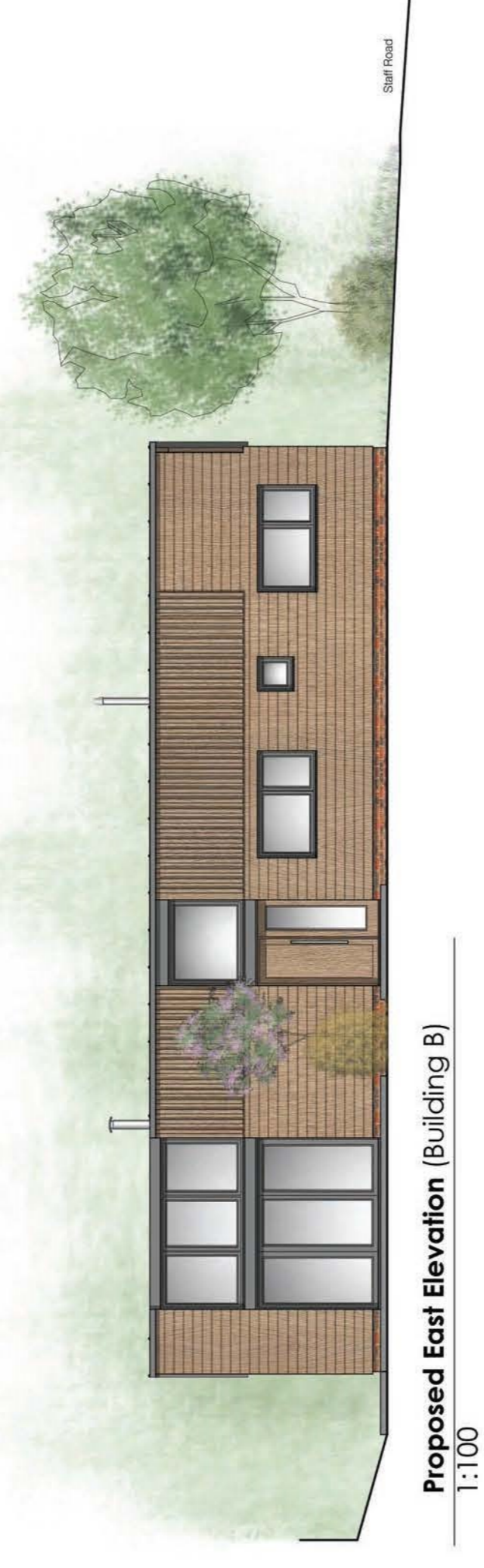
Proposed East Elevation (Building B) 1:100