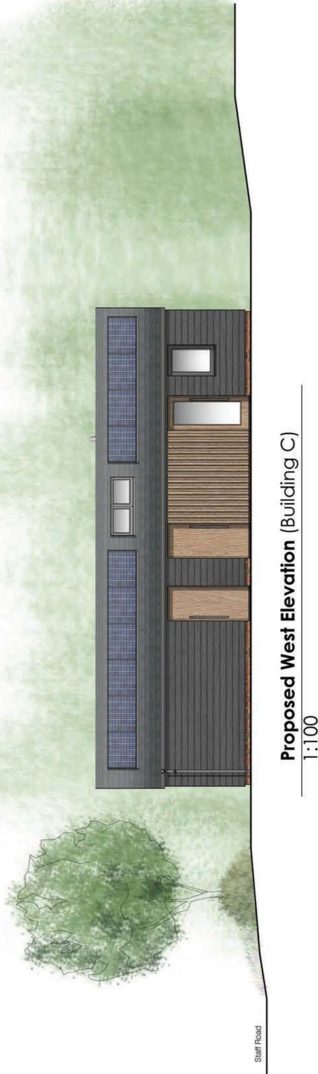
Proposed West Elevation (Building C) 1:100